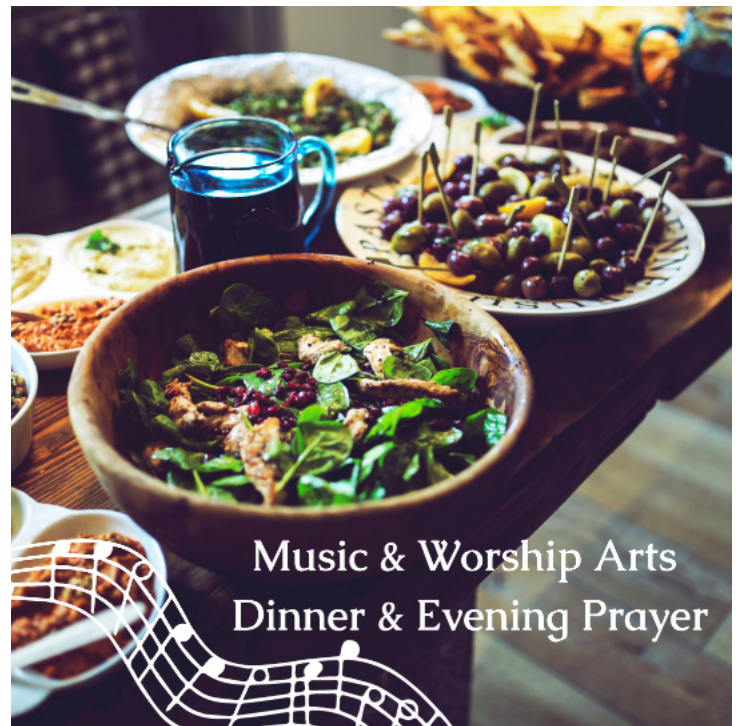
Music & Worship Arts Dinner & Evening Prayer