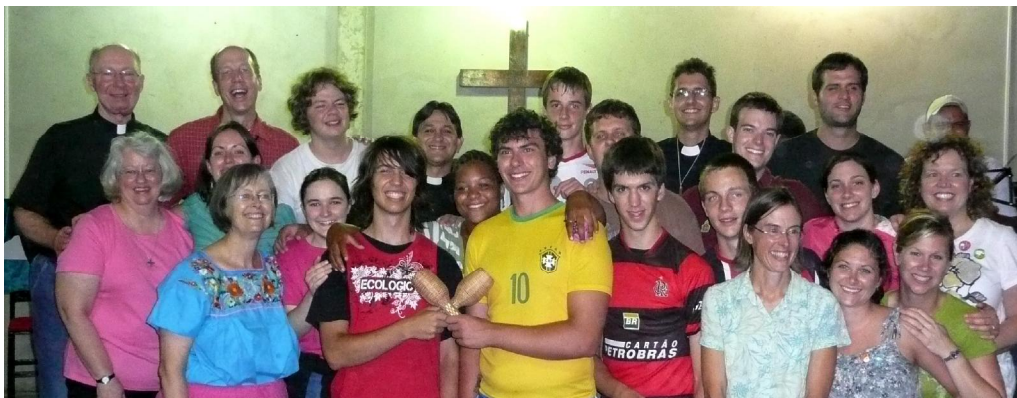
Summer 2010 Intergenerational Team